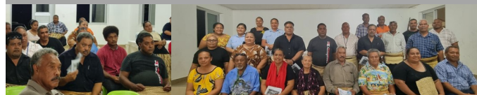
Photos above: from Pangai, Ohonua, Ta'anga, Houma and Tufuvali 'Eua