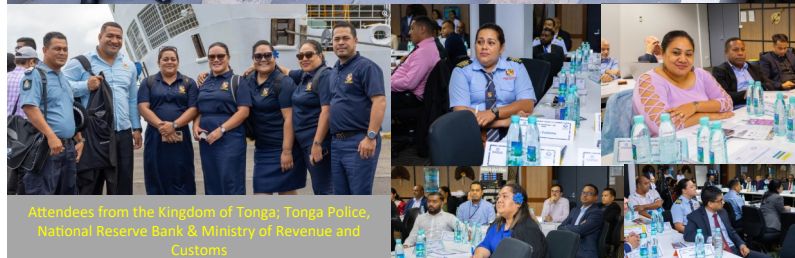
Attendees from the Kingdom of Tonga, Tonga Police, National Reserve Bank & Ministry of Revenue and Customs

The World Customs Organization (WCO) held its largest Anti-money Laundering and Counter Terrorism Financing (AML/CTF) workshop to date, which was proudly hosted by the Fiji Revenue and Customs Service (FRCS). This was a significant step towards strengthening the integrity of trade and financial systems in the Asia-Pacific region. This historic occasion, which was held in the FRCS Headquarters in Suva, was a component of the WCO's TENTACLE-Asia/Pacific Sub-regional Workshop series. The WCO's targeted campaign against large-scale cash smuggling, which encompasses the illicit trade in precious metals and jewels, is called Project TENTACLE. 74 participants attended the course, including representatives from INTERPOL, the EGMONT Group of FIUs, the Regional Liaison Officers in Asia Pacific (RILO AP), and 10 Customs administrations, 6 Financial Intelligence units (FIUs), and 6 Police administrations, the forum plays a crucial role in enhancing the ability of participants to combat money laundering and terrorism funding inside the Customs domain.