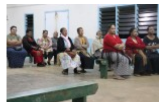
Participants from Vaini District at FWC HALL of Vaini .