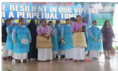
Action Song -FWC of Ma'ufanga youth.