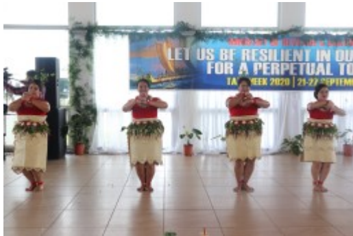
Tau'olunga -Ministry of Finance.