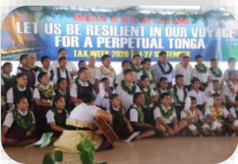
Singing and Tongan Traditional Dance - St. Francis of Assisi Primary School