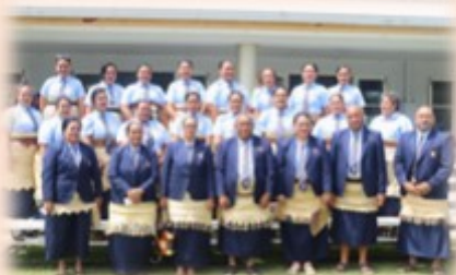
Staff of the Ministry of Finance and National Planning attended Tax Week Prayer Service