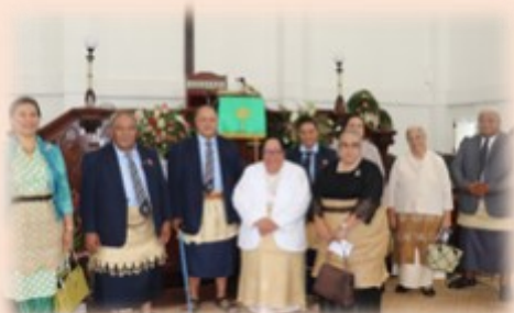
Minister and CEO of the Ministry of Revenue and Customs after the service.