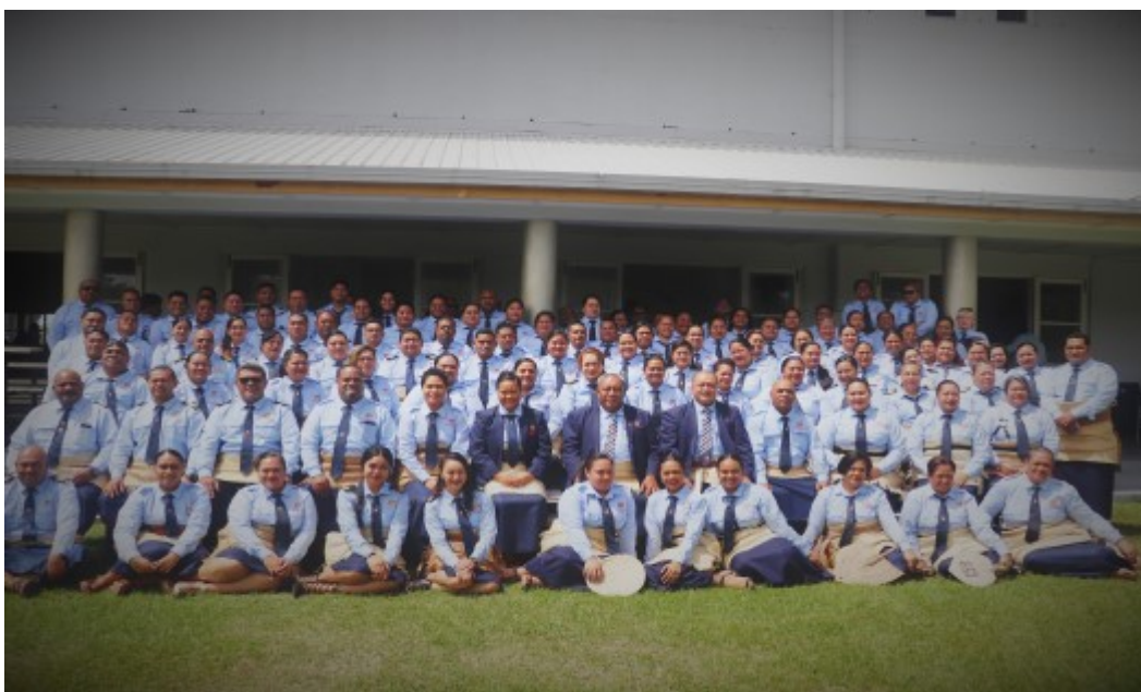
Staff of the Ministry of Revenue and Customs after the morning service at the Centenary Church of Tonga.

" FE'AOMOENGALU PEA SILA KI VAI KI HA TONGA 'OKU TU'UTAI"