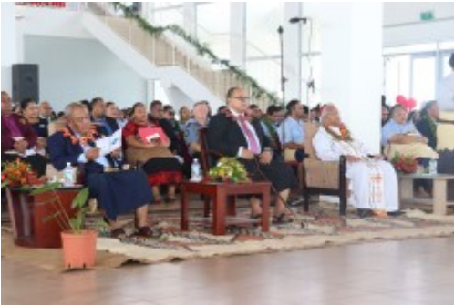
Guest of Honor –Hon Prime Minister ,Dr.Pohiva Tu'i'onetoa and the royal guest.