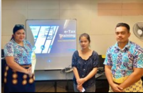
Cocker Enterprises eTax Training