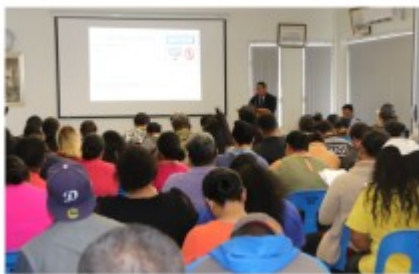
Participants - Custom Broker Training Course