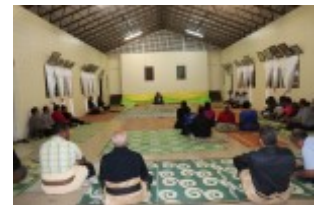
Participants from Ha'ateiho District at FWC HALL of Ha'ateiho

The Ministry hosted a FONO meeting throughout the whole Tongatapu as a part of Tax Week 2020.