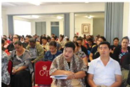
Participants - Custom Broker Training Course